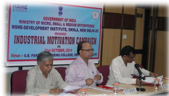
Industrial Motivational Campaign on 21 st October, 2014