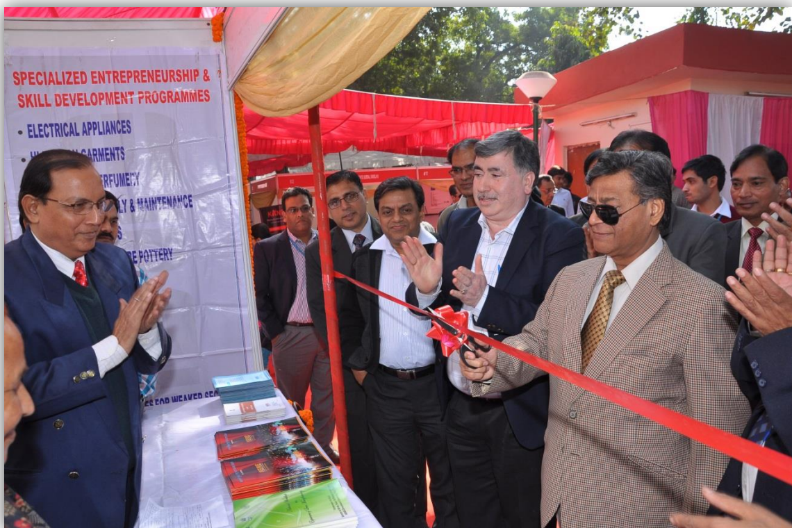
Photograph of NVDP on 10 th & 11 th December, 2014