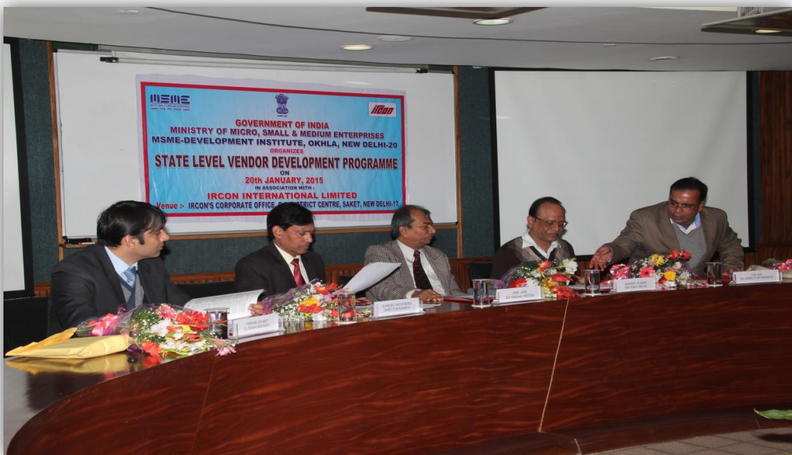
Photograph of SVDP on 20 th January, 2015 at IRCON, Saket, New Delhi