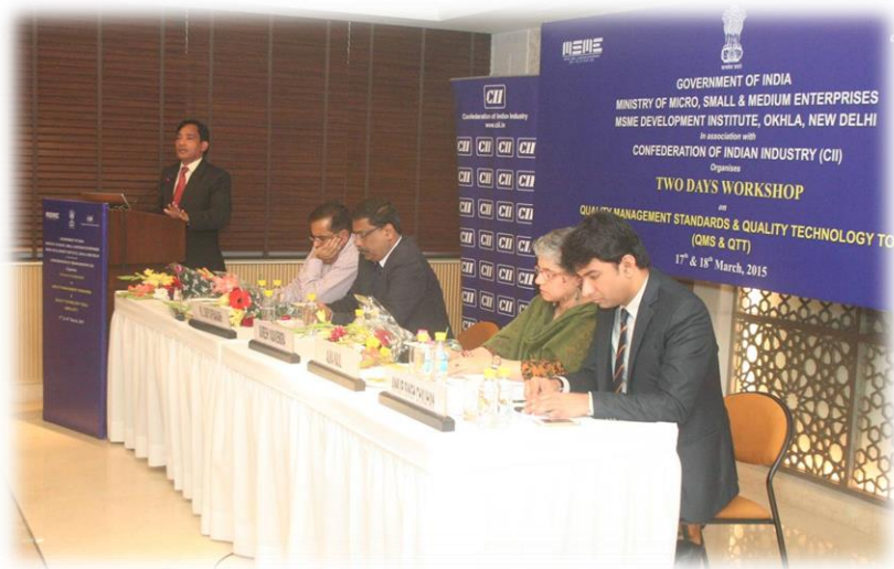
Two Day Workshop on QMS/QTT: 01 Participants : 100 Details at Page 30 & 31