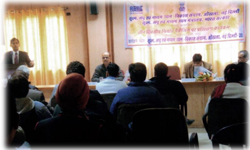
Packaging for Export : 01 Participants : 26 Revenue : Rs. 14,700 Details at Page 41