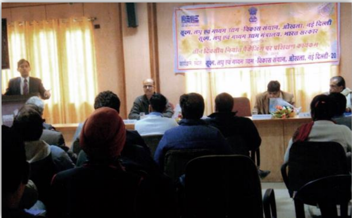
Photograph of Training Programme on Packaging for Exports