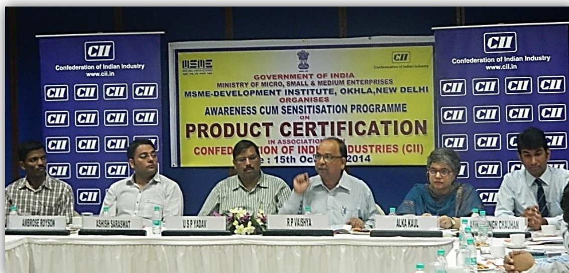
Photograph of Awareness Programme on Product Certification on 15 th October, 2014