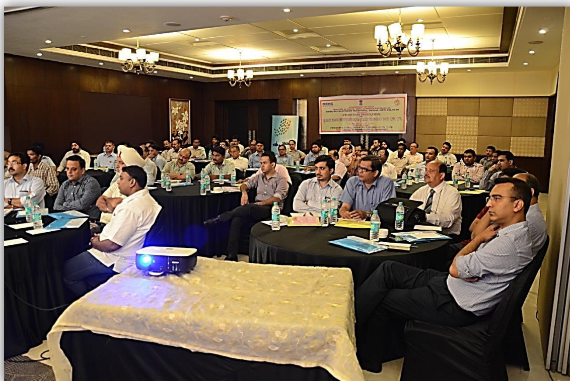
Photograph of Awarness Progrmme on QMS/QTT