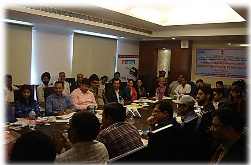
Awareness programme on EET : 04 Participants : 227 Details at Page 33