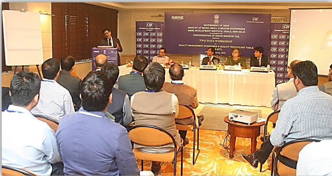
Photograph of Two Day Workshop on QMS/QTT