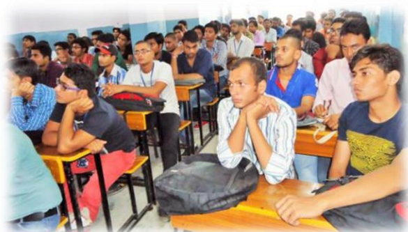
Industrial Motivational Campaign on 13 th August, 2014