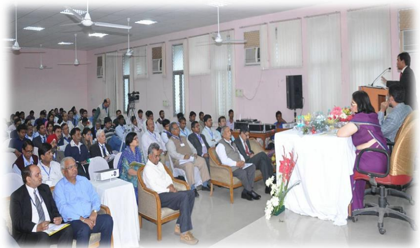
National Workshop on QMS/QTT : 01 Participants : 108 Details at Page 30 & 31