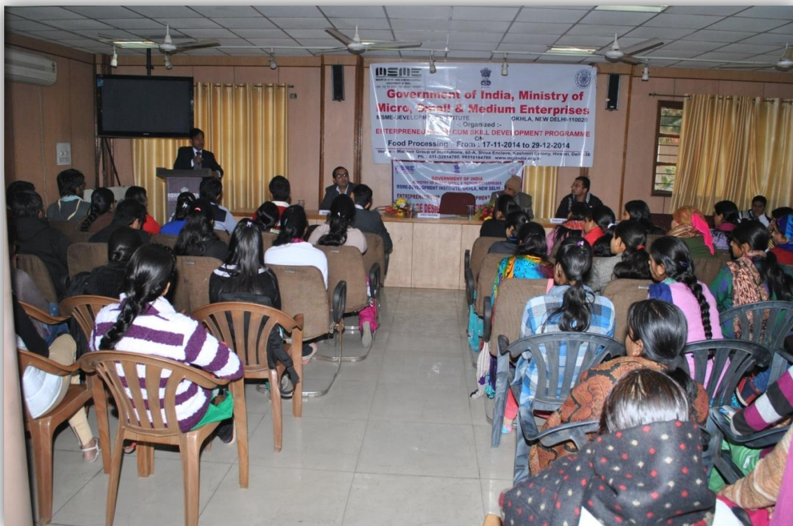
Photograph of ESDP on Food Processing organized from 17 th November to 29 th December, 2014