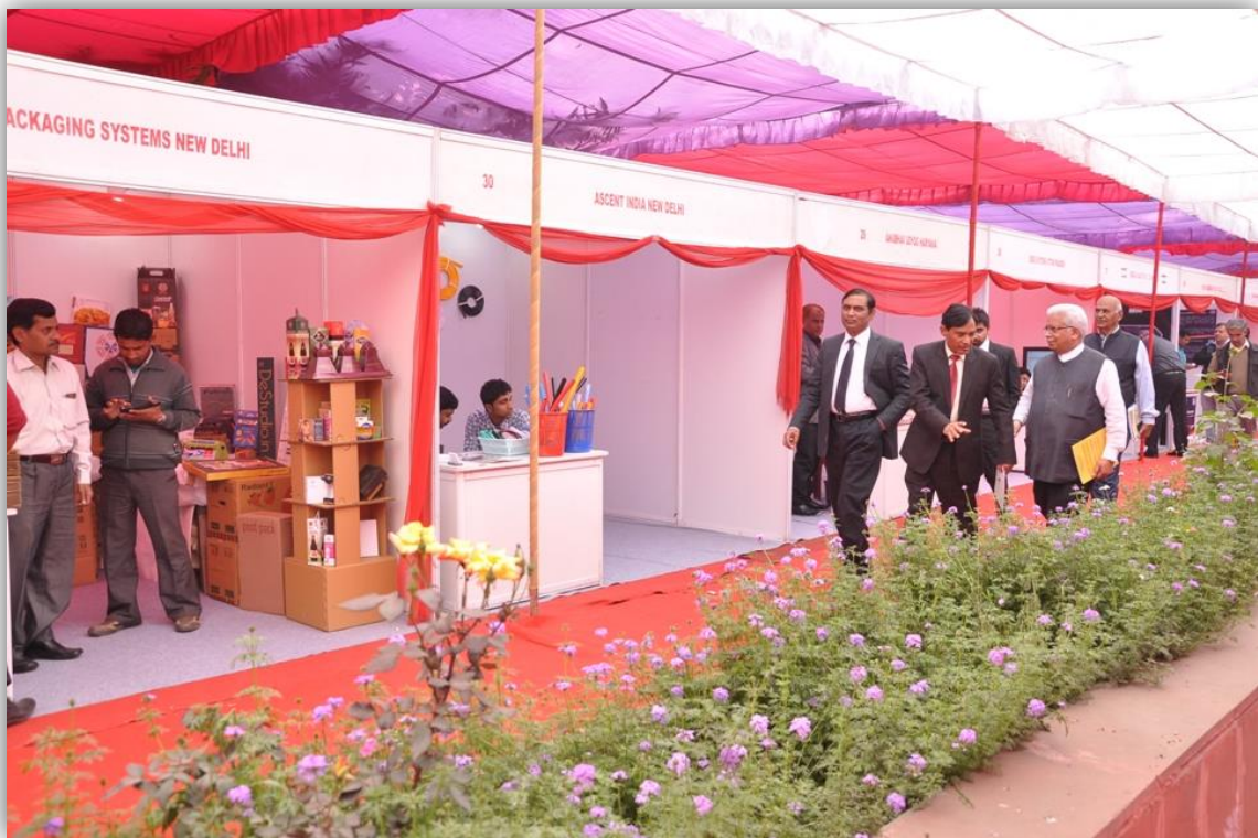
Photograph of NVDP on 19 th & 20 th February, 2015