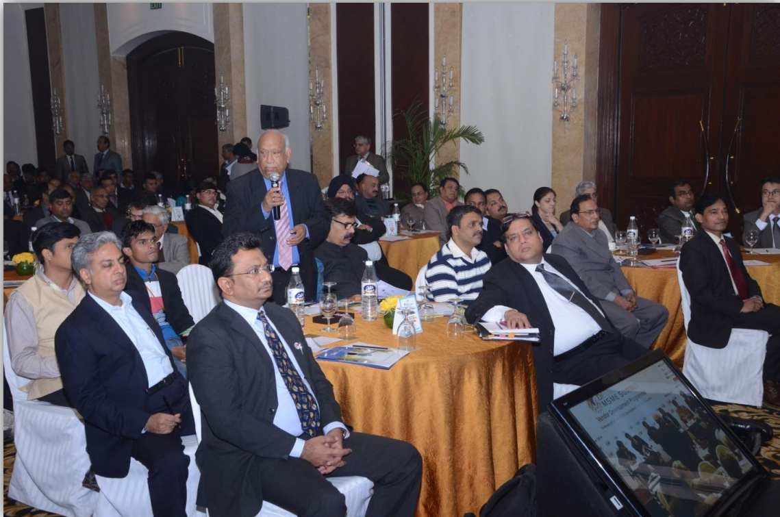
Photograph of SVDP on 19 th December, 2014 at Shangri-La Hotel, New Delhi