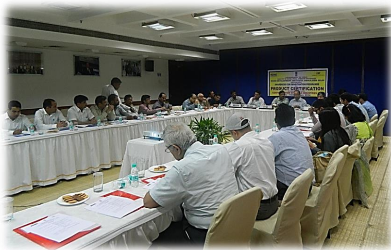
Awareness Programme on Product certification : 04 Participants : 173 Details at Page 32