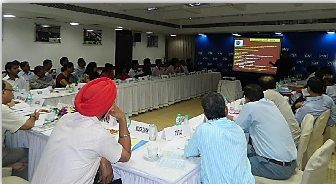
Photograph of Awareness Programme on Bar Code on 01 st September, 2014