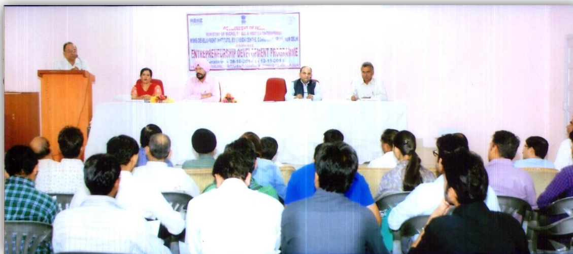
Photograph of EDP from 28 th October, 2014 to 12 th November, 2014