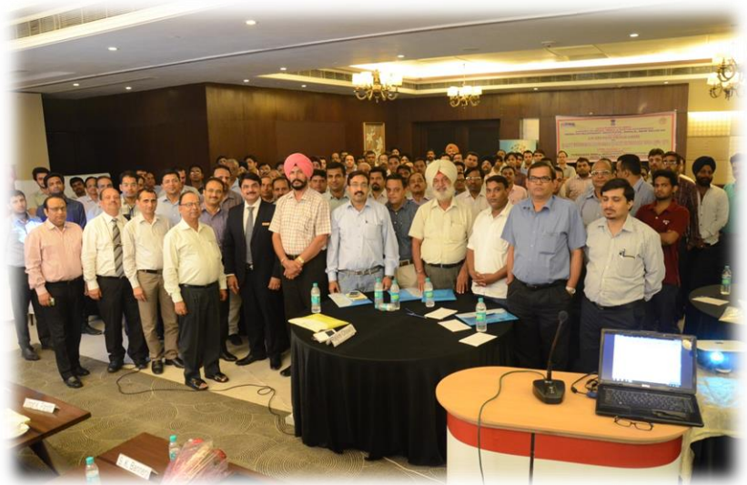
Awareness Programme on QMS/QTT: 01 Participants: 90 Details at Page 30 & 31