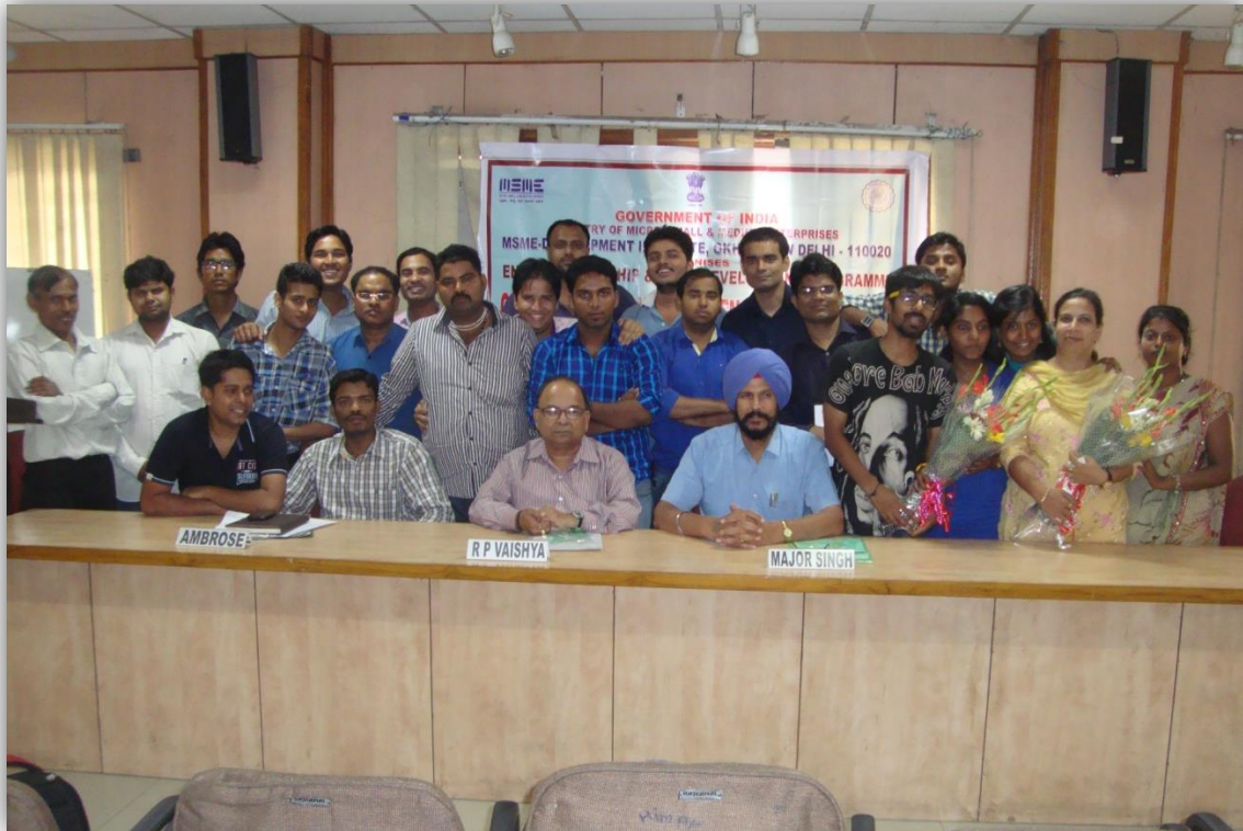
Photograph of ESDP on Optical Techniques and Lens Manufacturing from 4 th August, 2014 to 16 th September, 2014