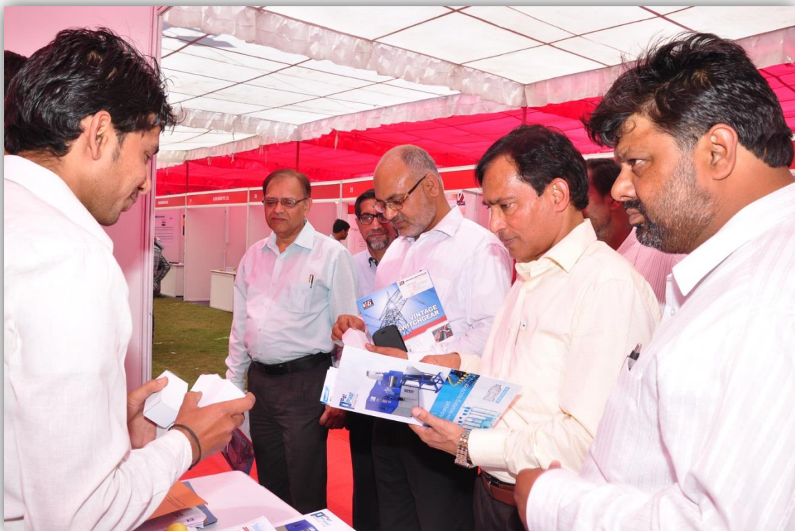
Photograph of NVDP on 24 th & 25 th March, 2015