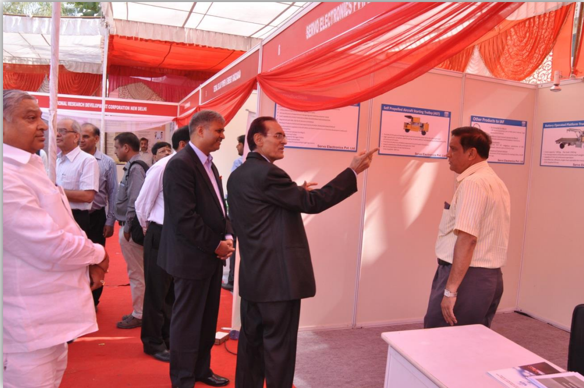
Photograph of NVDP on 10 th & 11 th October, 2014