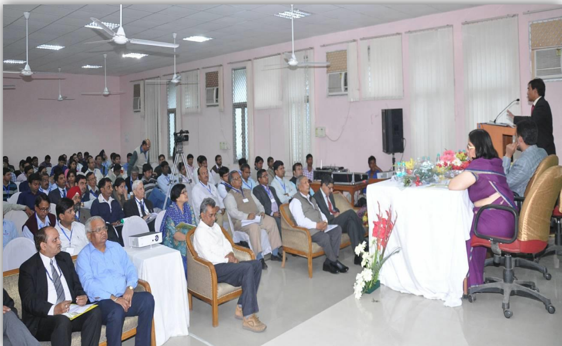
Photograph of National Workshop on QMS/QTT