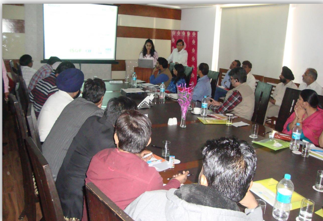
Photograph of Awareness Programme on Energy Efficient Technology on 20 th November, 2014